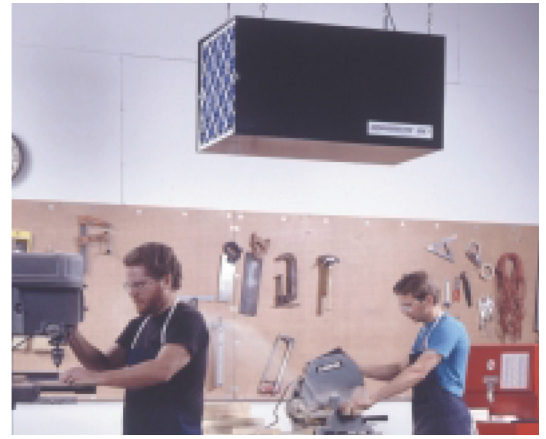
The M67 cleans wood particles and dust from wood shops.

This product is not available for resale or installation in California.