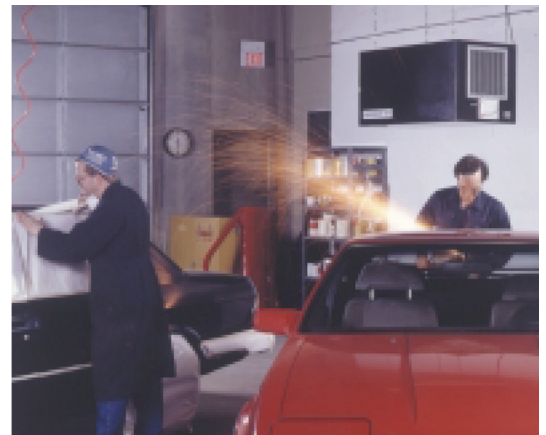
The M67 is perfect for autobody shops.